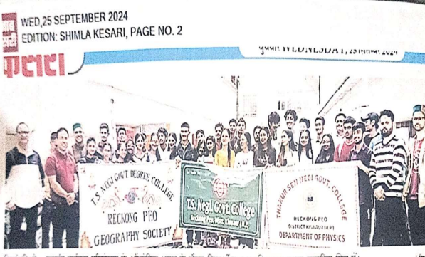
रिकांगपिओ : काशंग हाइंडल परियांजना के औद्योगिक भ्रमण के दौरान विद्यार्थी तथा महाविद्यालय स्टाफ सामहिक चित्र में।